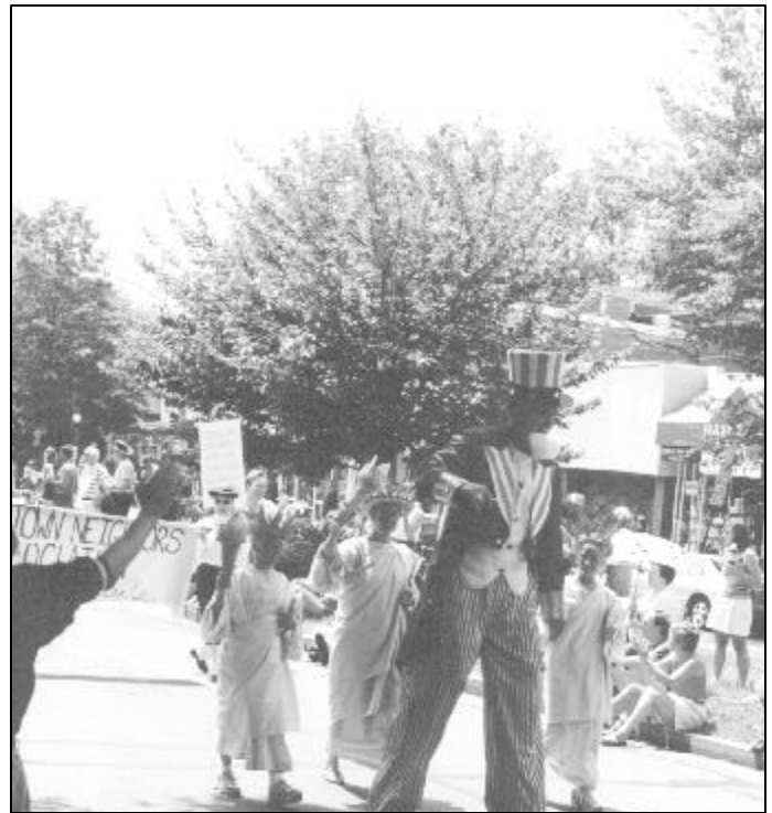
Uncle Sam is a crowd-pleaser at the 2000 4th of July Parade.