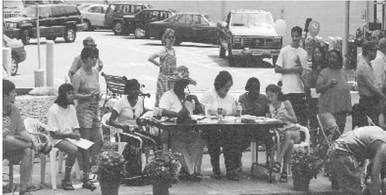
The "Official" judging booth for the 4th of July Parade.